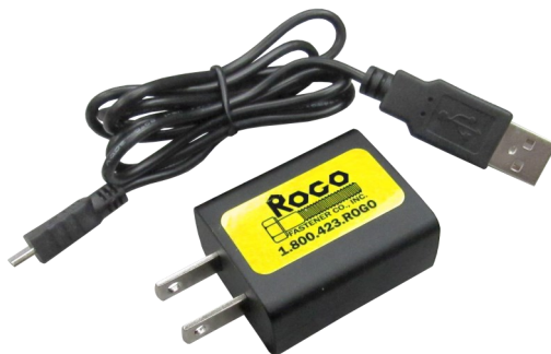
Wall Charger (USB)